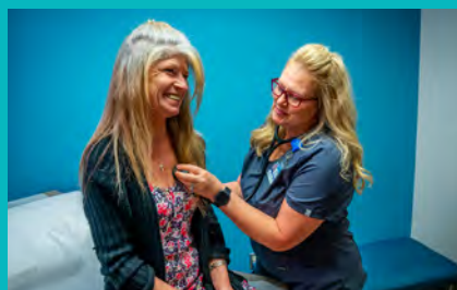
PRIMARY MEDICAL CARE