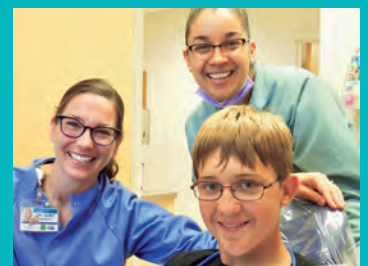
COMPREHENSIVE DENTAL CARE