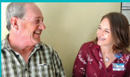
INTEGRATED BEHAVIORAL HEALTH CARE

*Mesa County Public Health's 2021-2023 Community Health Needs Assessment (CHNA)