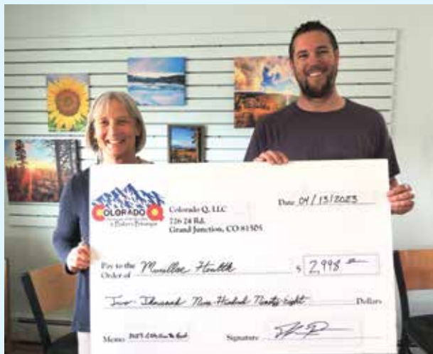
Baker's Boutique's "Big Check" from Gifts from the Heart.