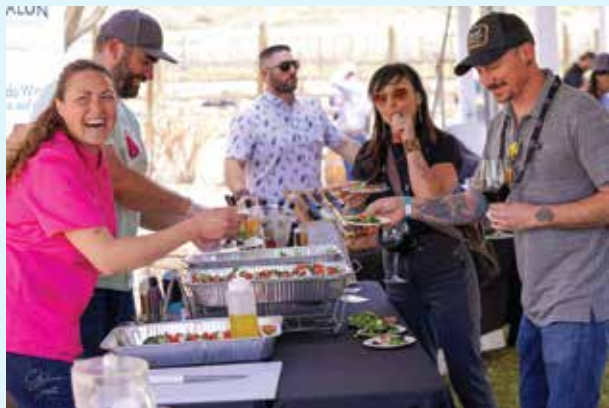
Fun at Edesia