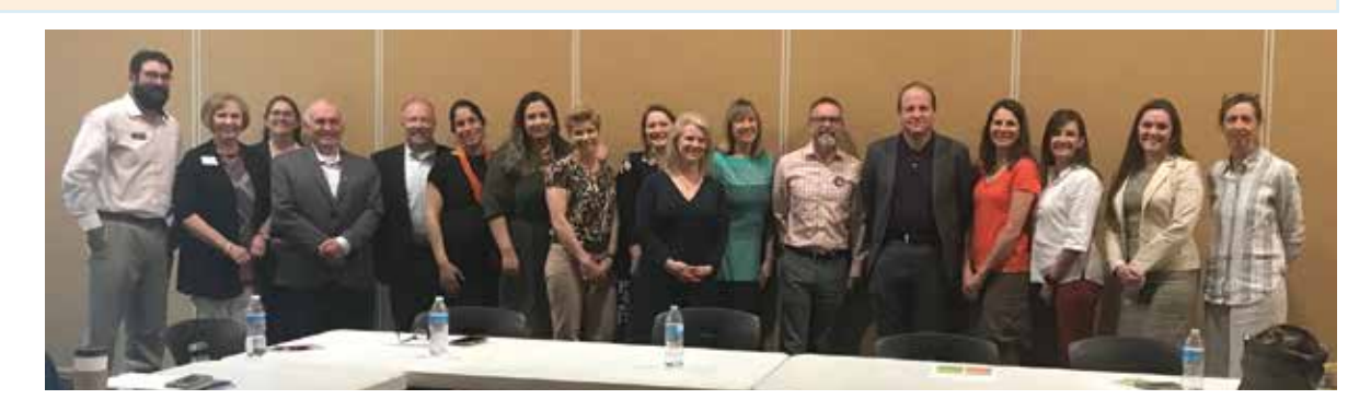
When Governor Polis was in town in mid-April, he took the time to meet with representatives of various Mesa County nonprofit and governmental organizations - including MarillacHealth - to hear and learn about the Community Transformation Project. This is an effort led by Mesa County Public Health to use the collective strength of organizations and residents to achieve better community health by building stronger neighborhood connections in Clifton. To learn more about this long-term effort, go to: HealthyMesaCounty.org/health-care/transformation

MarillacHealth continues to lead by example with innovations and patient-centered healthcare that addresses patient needs in an efficient and cost effective way.